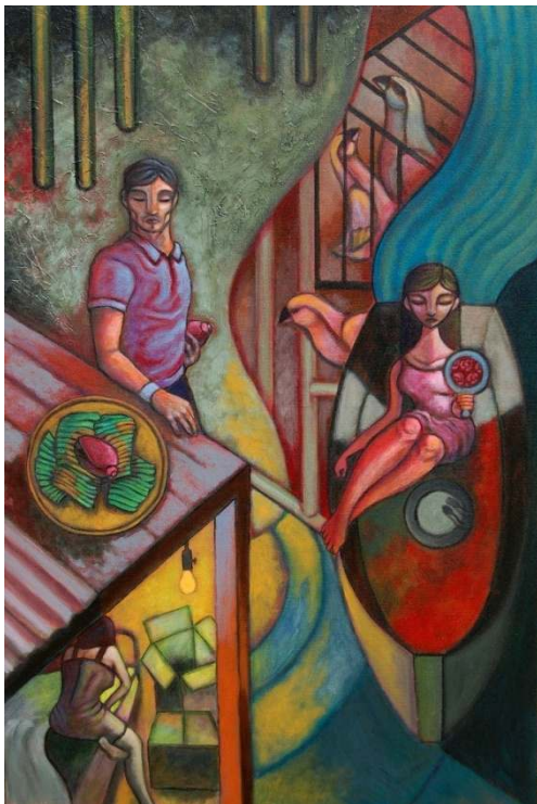
Amatus et Amissus Acrylic on Canvas 24" by 36" 2012