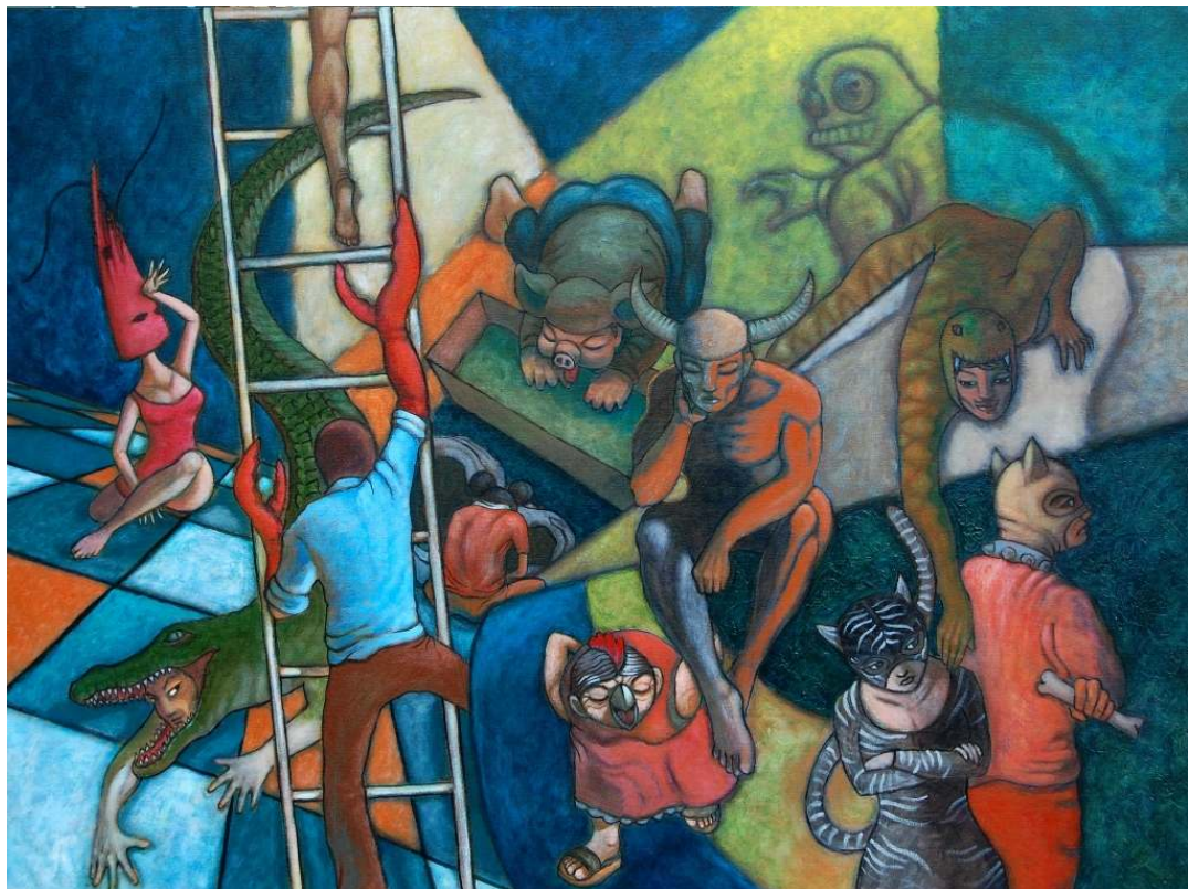
Theatrum Bestiarum (Animal Theater)