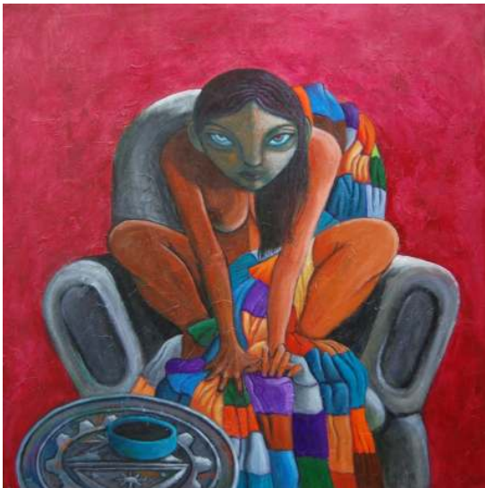
Ars Meretrix (Art Whore)