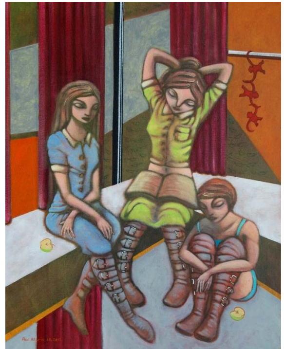
Escape from Exotica 30" by 24" 2012