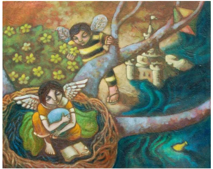
Finis Innocentiae (End of Innocence)