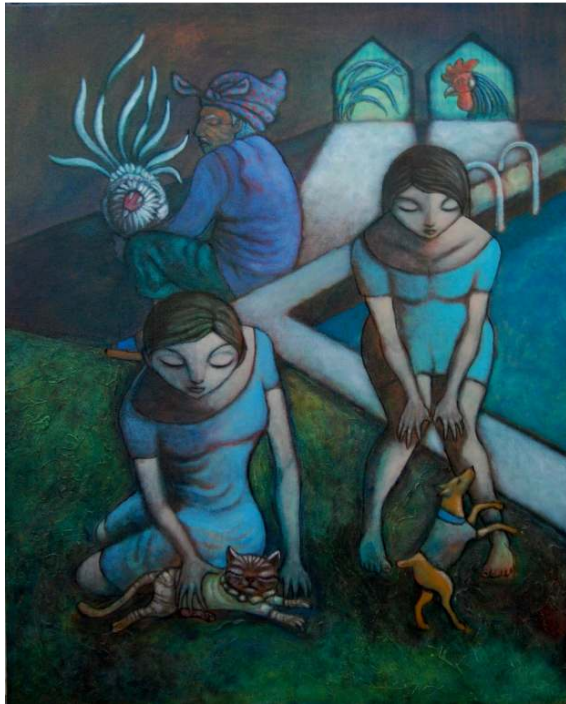
Capita aut Navia (Head or Tail) Acrylic on Canvas 30" by 24" 2012