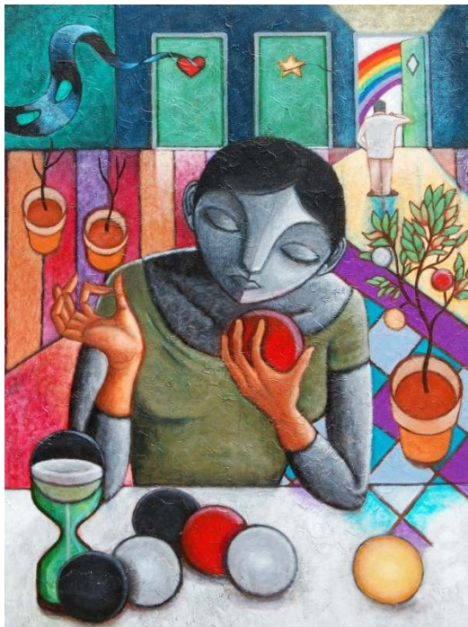
Dubitatio (Indecision) Acrylic on Canvas 36" by 48" 2012