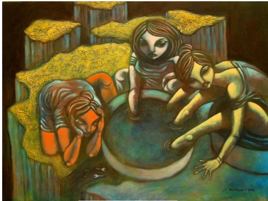
Avaritia (Greed) Acrylic on Canvas 36" by 48" 2012