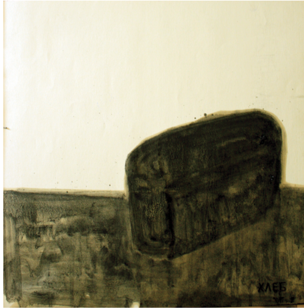
paper / oil 60 sm x 60 sm