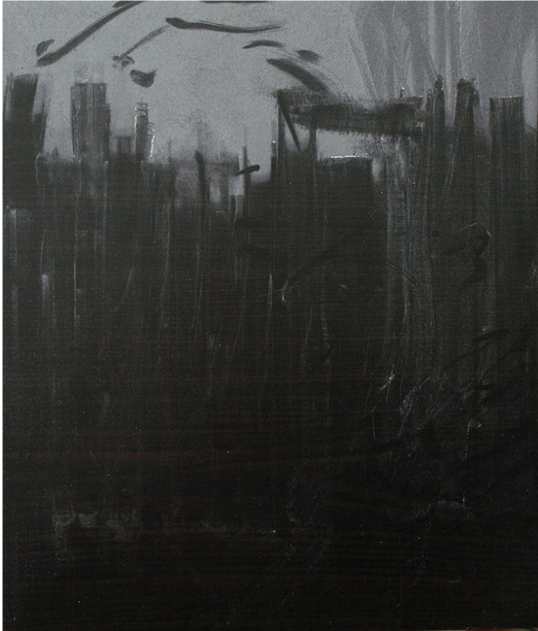
wood / dust 40 sm x 110 sm