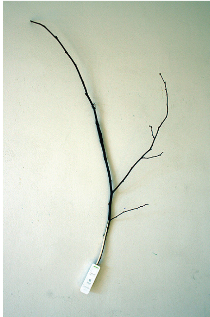
iPod / wood / sound 80 sm x 40 sm x 5 sm