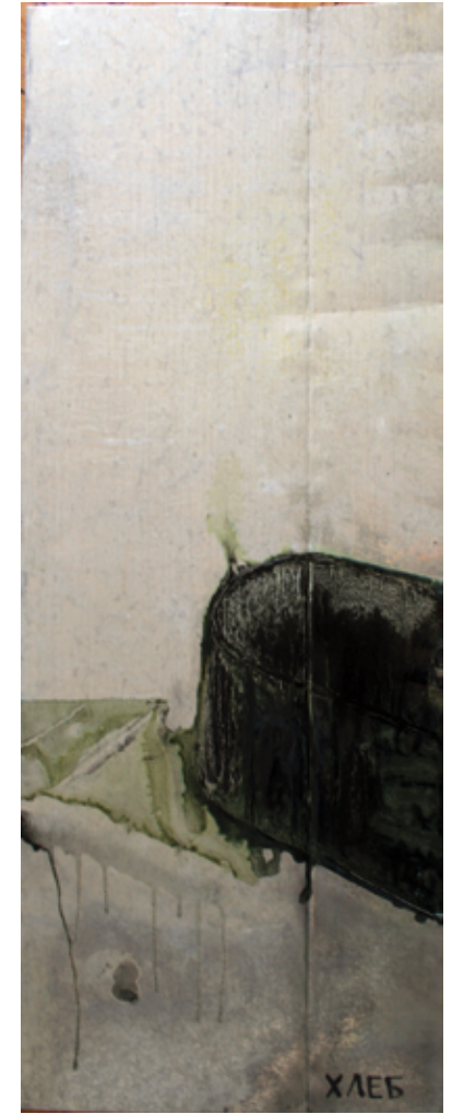
iron / oil 82 sm x 32 sm