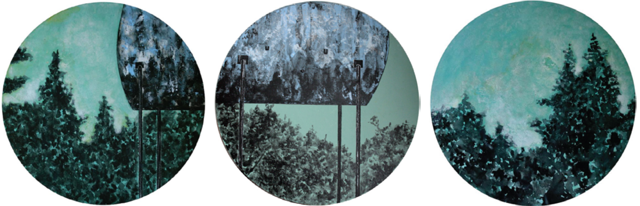
canvas /mixed media 46 sm x 46 sm