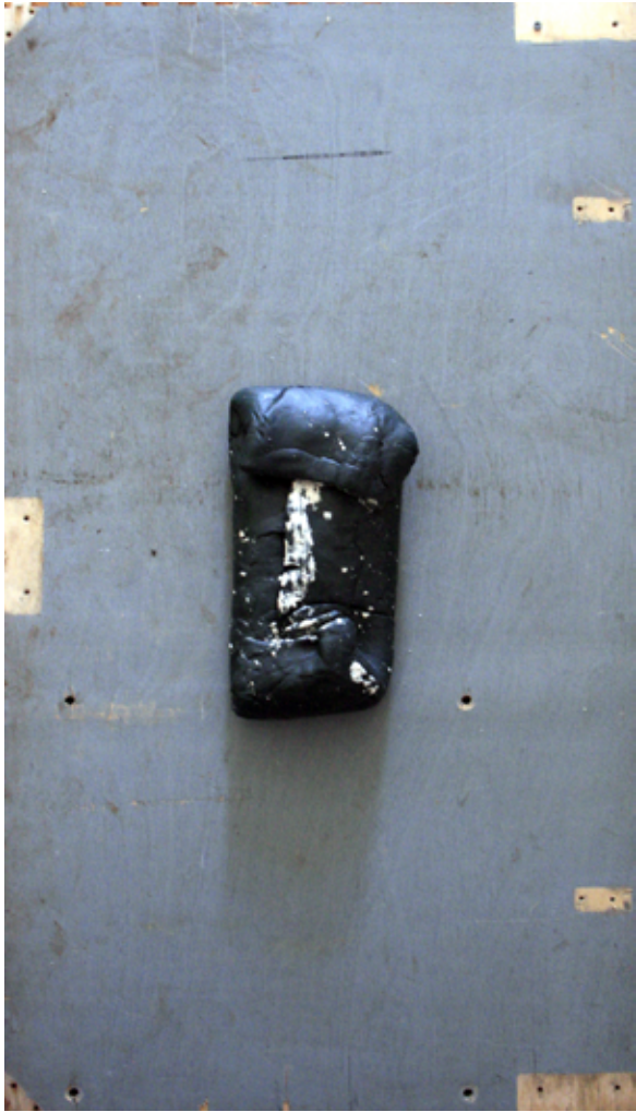
wood /mixed media 75sm x 42sm