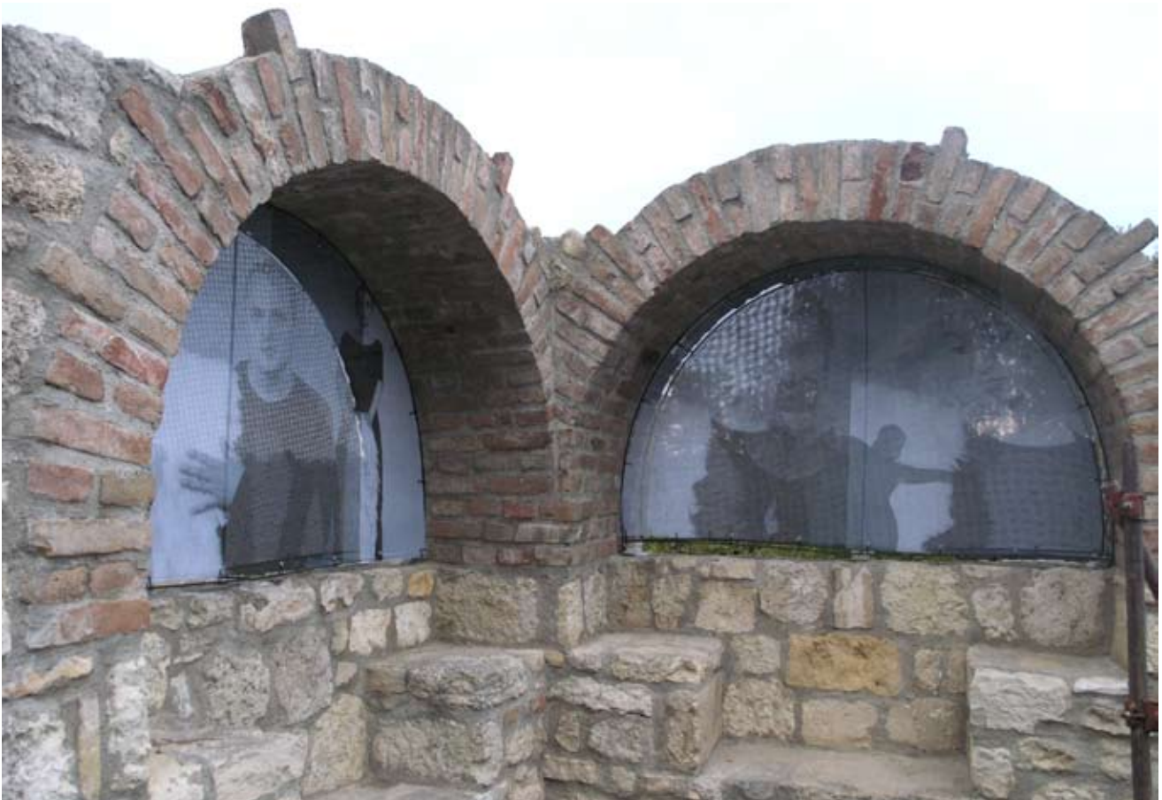
“The Angels of Metropolitan palace”, site-specific project, Belgrade Fortress, remains of Metropolitan palace, European Heritage Days, Belgrade, Serbia, 2007.