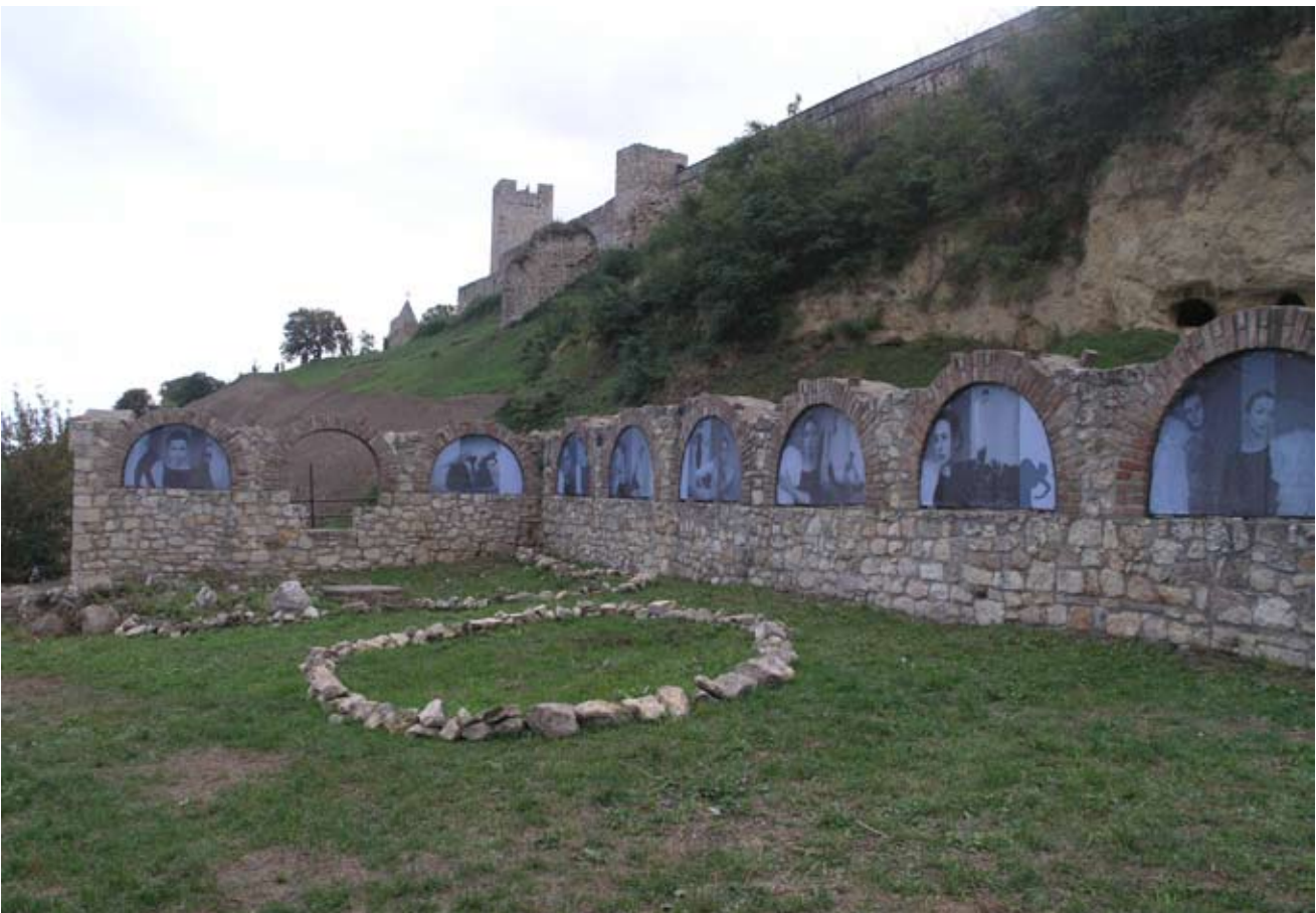
“The Angels of Metropolitan palace”, site-specific project, Belgrade Fortress, remains of Metropolitan palace, European Heritage Days, Belgrade, Serbia, 2007.

Site specific art is art which exists in, and is created for, a specific space, from which it adopts or draws its meaning. As opposed to the implantation/installation of a cultural event into an attractive environment, site-specific projects highlight the very characteristics of their environment; the work exists in a dialogue and specific interaction with its authentic space. The work functions as an integral element of the space; it is both dependent on and inseparable from the location, and it collaborates with the constituents of the selected site.