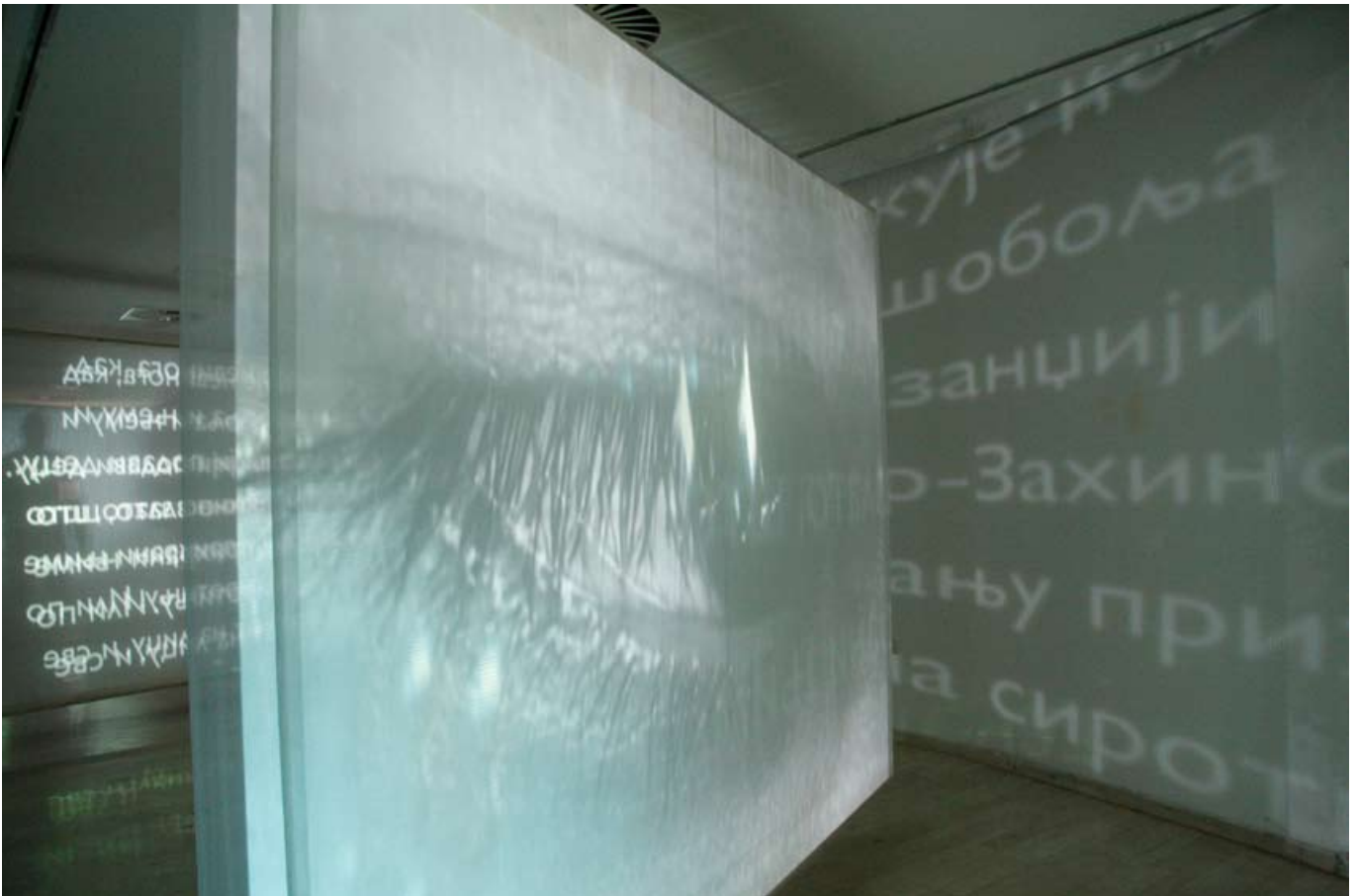
Video installation for the exhibition “One writer festival 2009 - Secrets of Momčilo Nastasijević”, Cultural center Belgrade, Serbia, 2009.

A specific visual exploration based on an interaction of visual arts and literary texts. The project is based on an ever present problem of the modern art, perceived widely as the relationship between visual and verbal expression, between visual art and literary text.