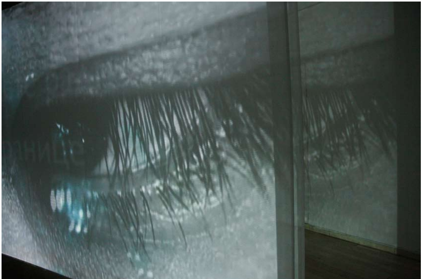
Video installation for the exhibition “One writer festival 2009 - Secrets of Momčilo Nastasijević”, Cultural center Belgrade, Serbia, 2009.