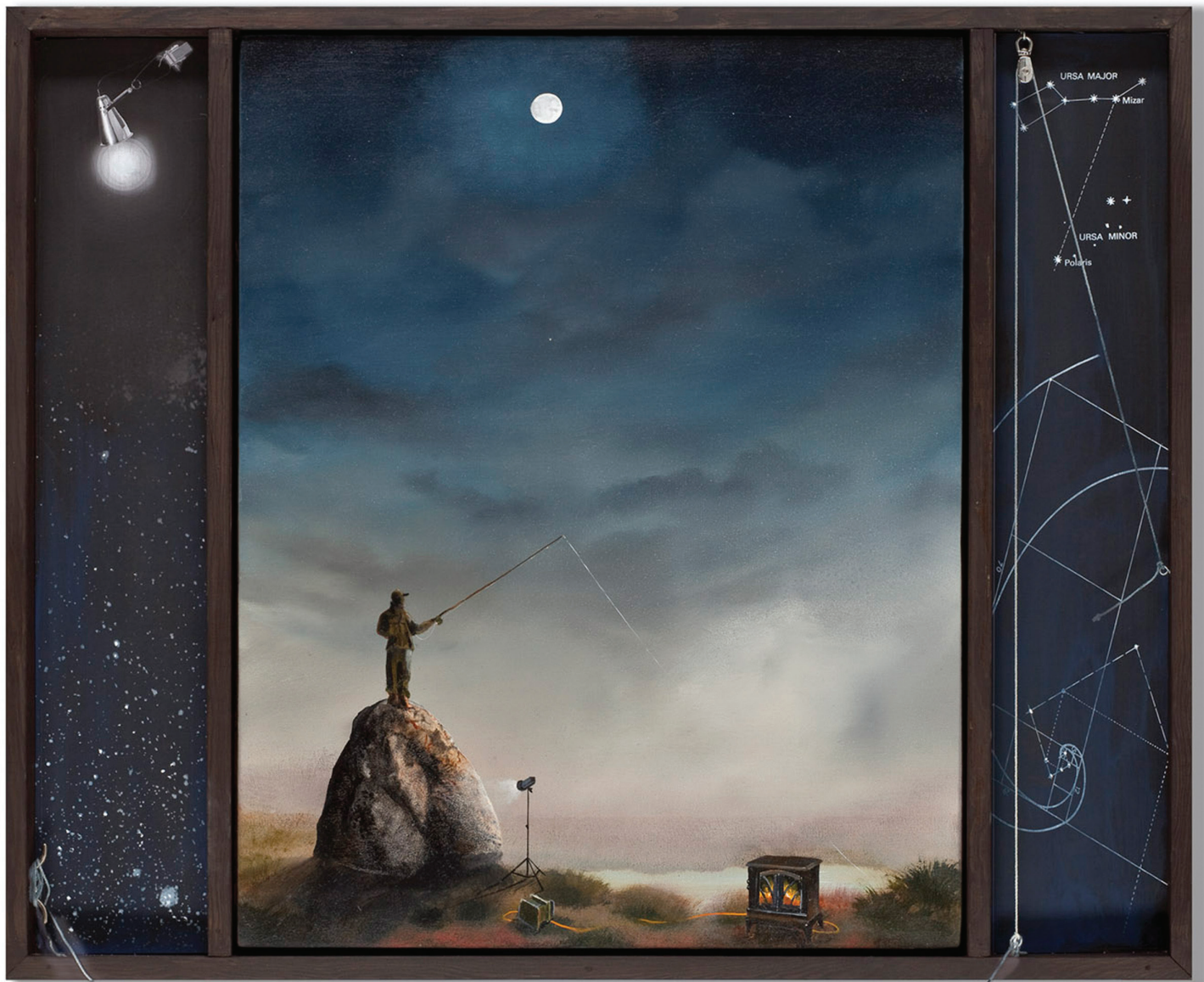
Rock Fishing By Moonlight Mixed Media 30h x 36w