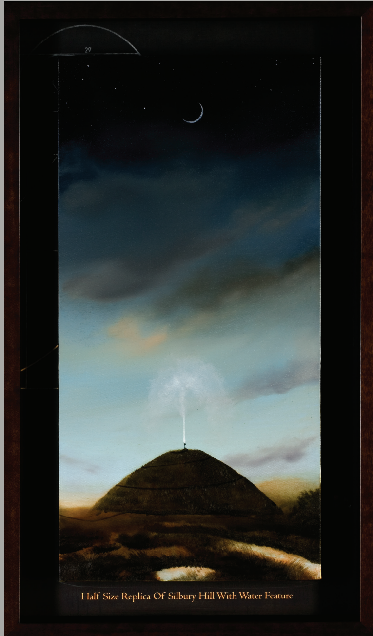
Half Size Replica Of Silbury Hill With Water Feature