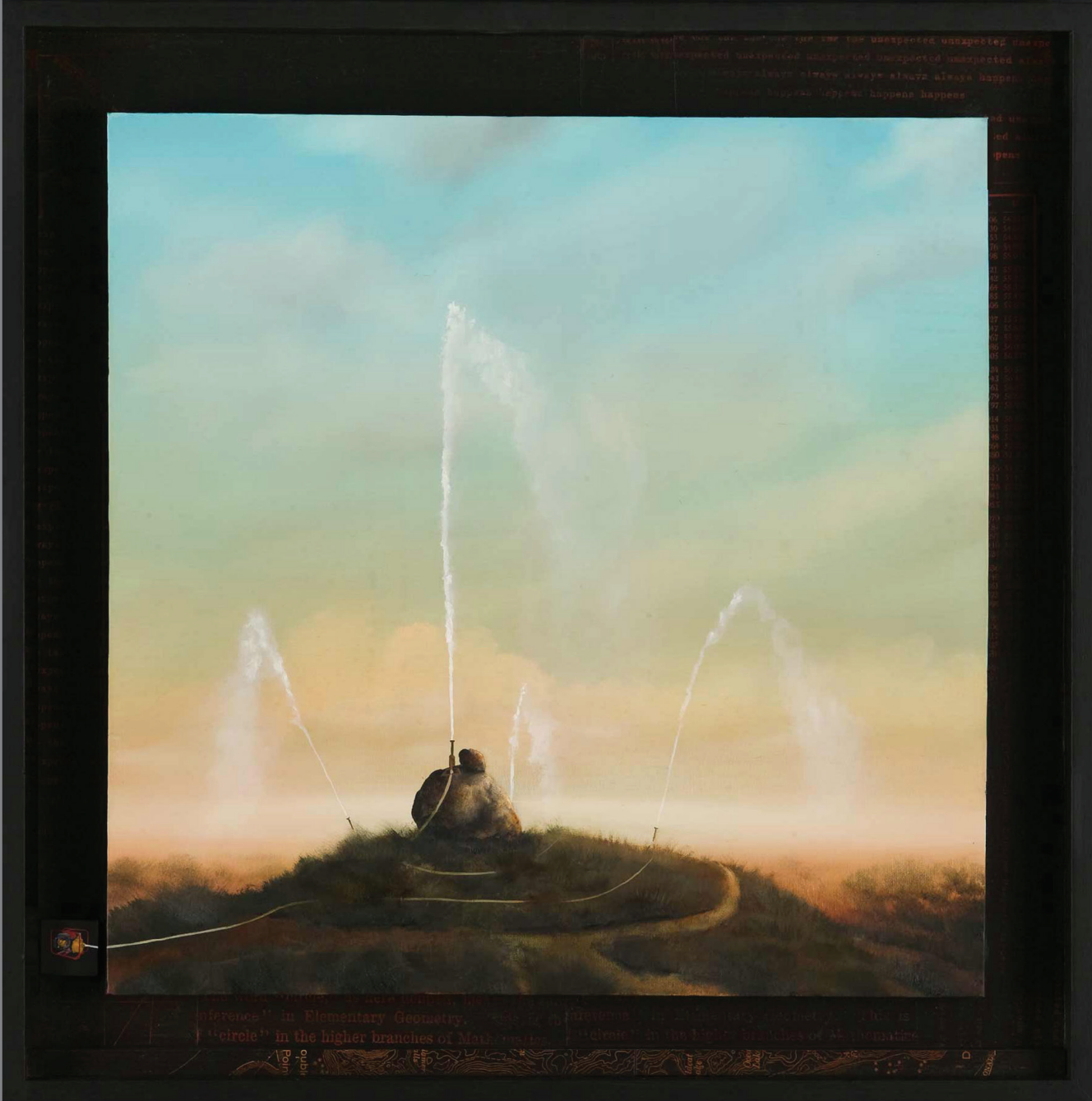
Small Mound With Water Feature