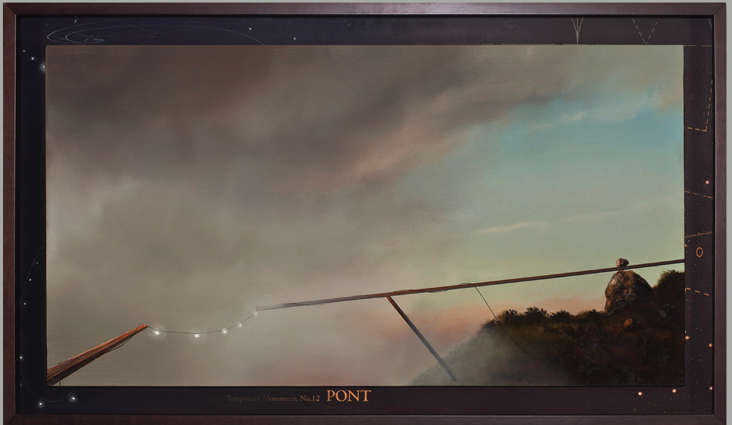
Temporary Monument No.12 PONT