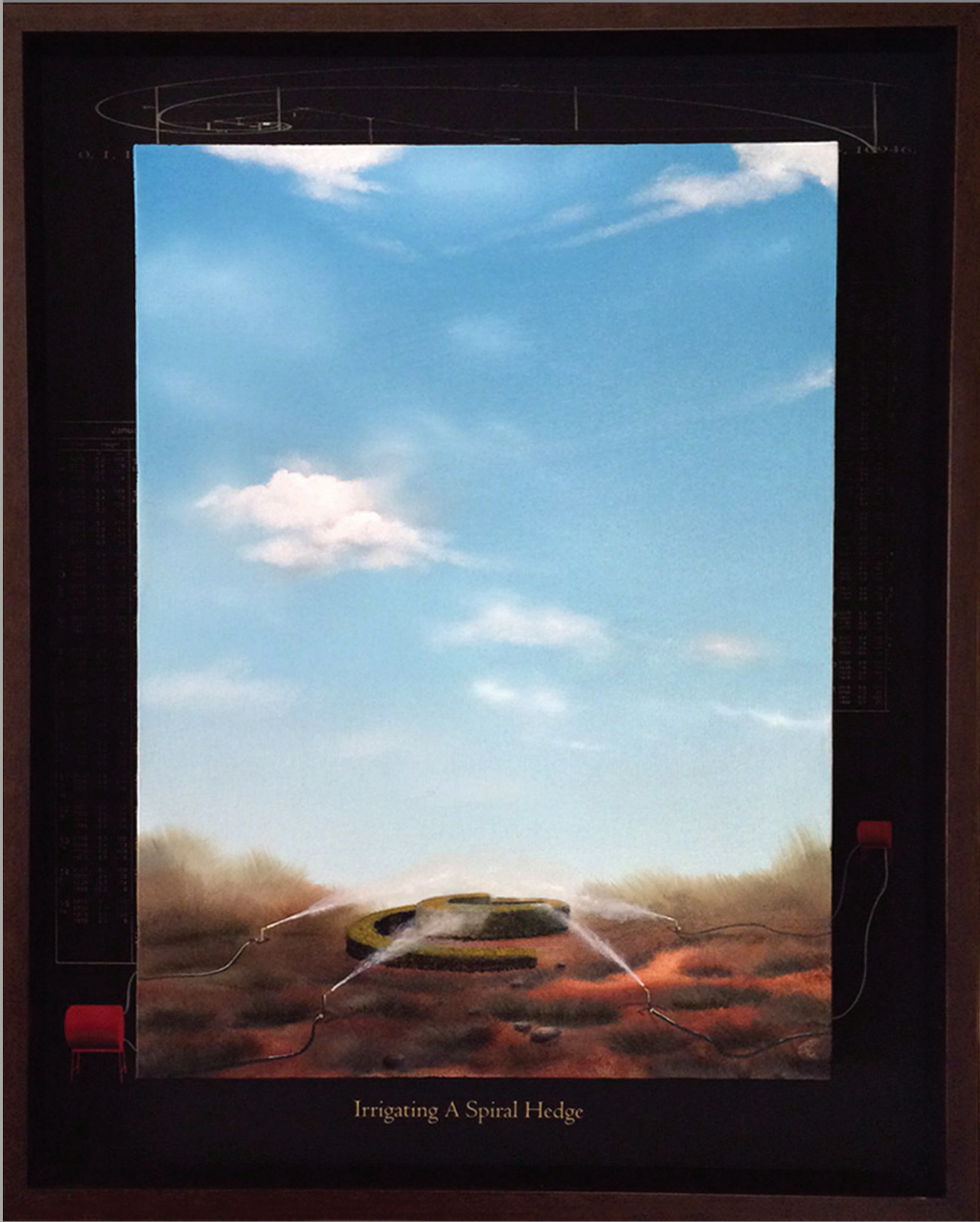
Irrigating A Spiral Hedge