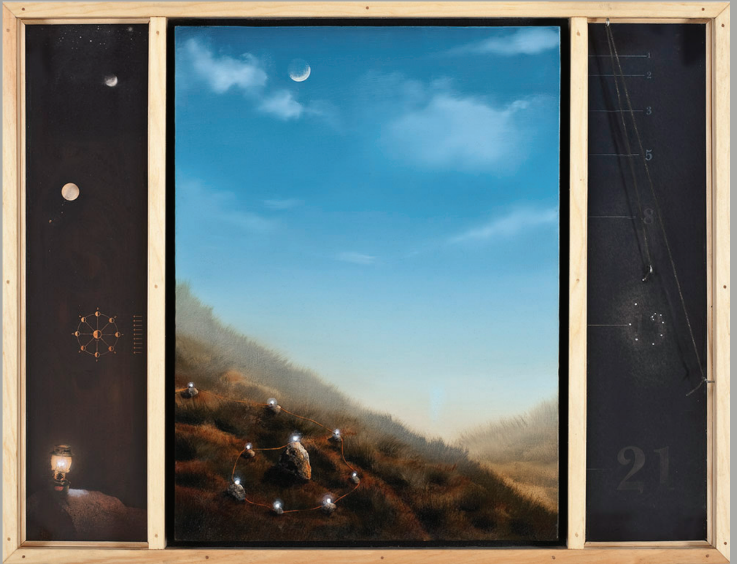
Fibonacci (Partial View) With Spheres